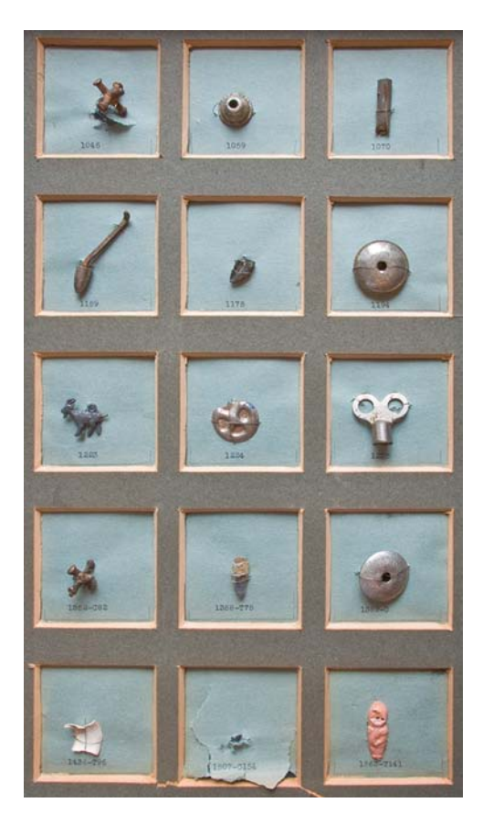
Toys and toy parts from the Chevalier Jackson Foreign Body Collection.

foreign body, whereas a faulty one balances precariously upon it.