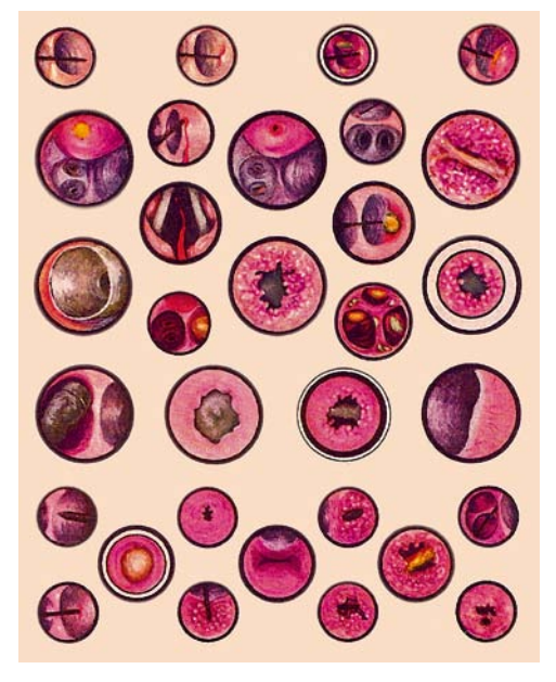
An example of the kind of illustration of bronchoscopic, esaphogaoscopic, and gastroscopic views that Jackson painted to accompany many of his articles and textbooks. From Jackson's Diseases of the Air and Food Passages of Foreign Body Origin, 1936.

The body's interior fills up the doctor's eye as he peers down the tube-it is all that there is in the world for that moment-and yet his is a severely compromised view, since he only sees what appears directly in front of him inside a contracting and expanding circumference. But touch is not diminished—rather, it is heightened, as the operator feels his way in, sensing rigidities and resistances in the body, sensing the intensity and direction of the instrument's insertion, gauging depth so as not to go too deep, all the while watching for collapsing walls and clamping folds. The eve must not mistake one opening for another, of course, but Jackson trained his students to feel anatomical parts, chinks, and byways with the distal end of the tube, and with practice to acquire what he called a "nerve-cell habit" in their fingers until manipulating human anatomy with these instruments was done "subconsciously as with the knife and fork in eating," and could be conducted with "the delicacy of touch of a violin bow."