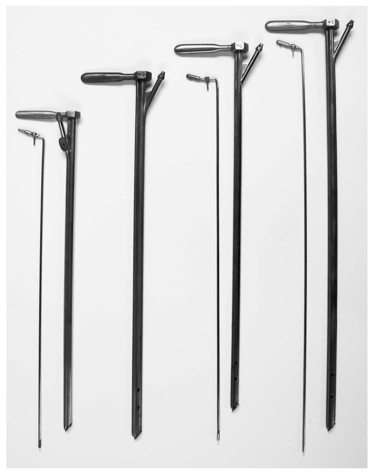
An array of scopes from Jackson's instrumentarium, with accompanying distal lights.